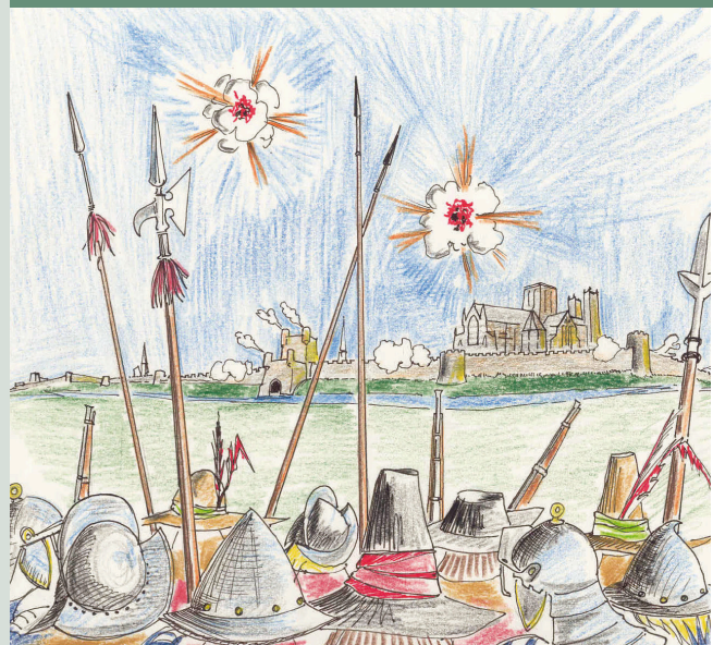
Siege of York