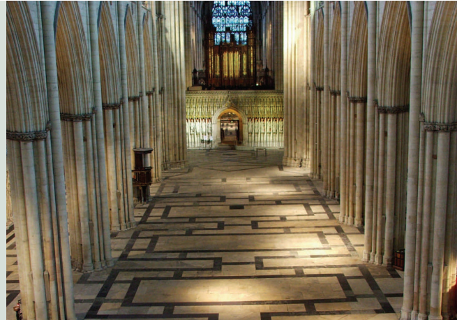
The Burlington "Greek Key" Pavement.