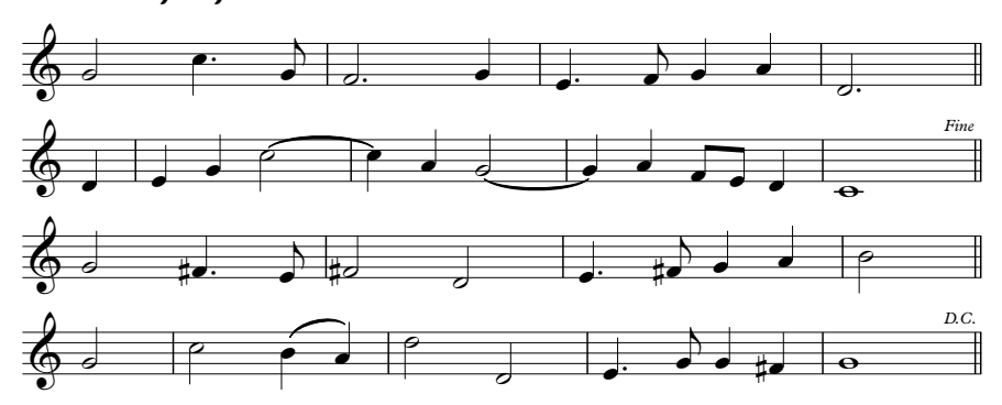
Lift high the cross, the love of Christ proclaim till all the world adore his sacred name.