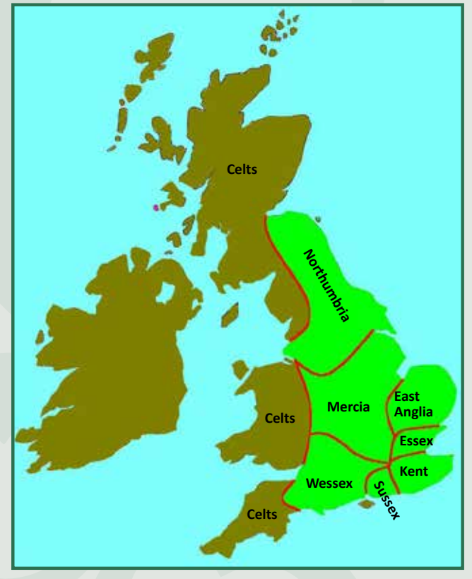
The Anglo Saxon Heptarchy

At first the Anglo Saxons established separate, independent kingdoms in eastern England. By the early seventh century there were seven kingdoms and these are often referred to as the theHeptarchy. The kingdom of Kent was the first to adopt Christianity, when King Ethelbert was converted as a result of the missionary work undertaken by St Augustine of Canterbury.