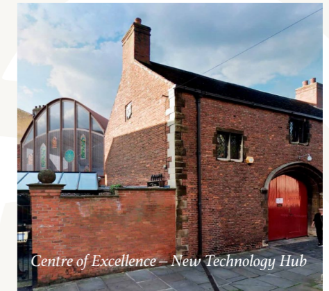
Centre of Excellence – New Technology Hub