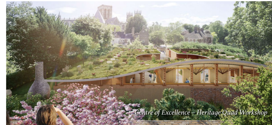
Centre of Excellence – Heritage Quad Workshop