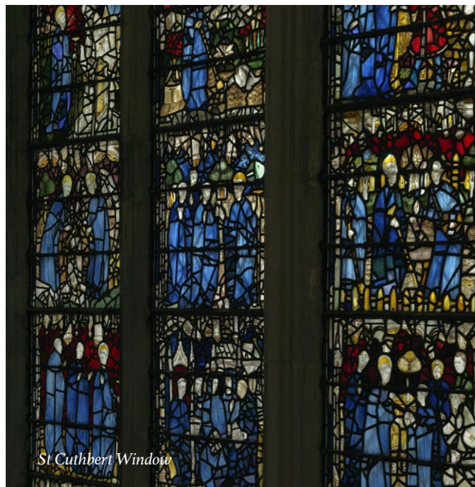
St Cuthbert Window