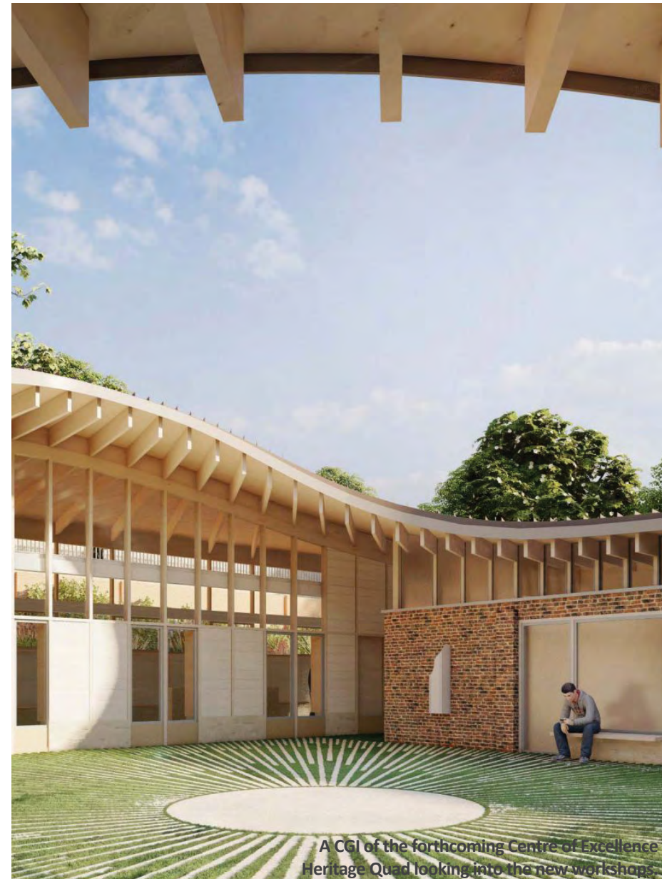
A CGI of the forthcoming Centre of Excellence Heritage Quad looking into the new workshops.