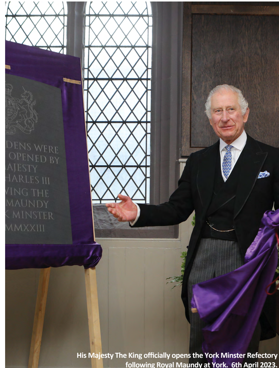
His Majesty The King officially opens the York Minster Refectory following Royal Maundy at York. 6th April 2023.

https://yorkminster.org/discover/centre-of-excellence-for-heritage-craft-skills-and-estate-management/