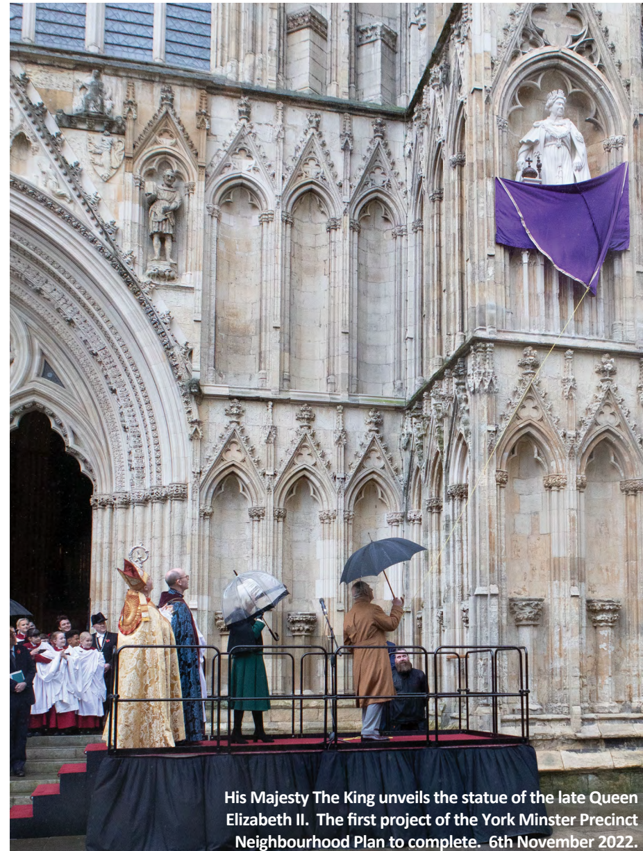
His Majesty The King unveils the statue of the late Queen Elizabeth II. The first project of the York Minster Precinct Neighbourhood Plan to complete. 6th November 2022.