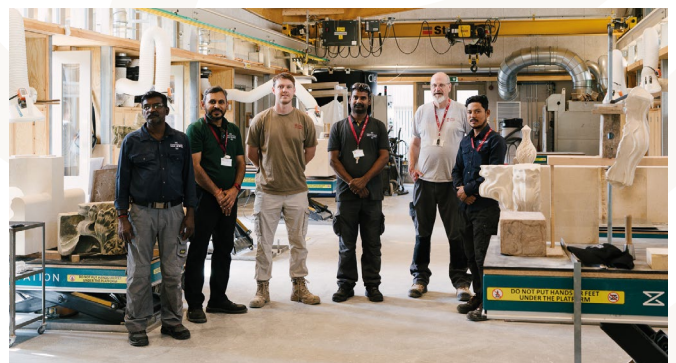
Visiting stonemasons from the Commonwealth War Graves Commission in India

York Minster's long-awaited Centre of Excellence opened this year, setting a new standard for heritage craft and estate management. The two new sites combine world-class facilities with cutting-edge technology to train apprentices and preserve traditional skills for future generations. This milestone marks a major step in caring for the Minster and ensuring its long-term sustainability. We would like to extend our gratitude to all who supported the Centre; every contribution matters.